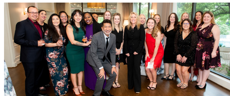
Presenting Sponsor, LiquidAgents Healthcare's Group

Presenting Sponsor LiquidAgents Healthcare